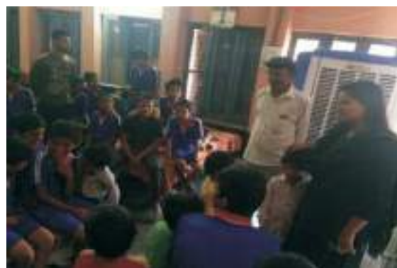
Lakhiram Arya Orphanage Shelter Home, Rohtak