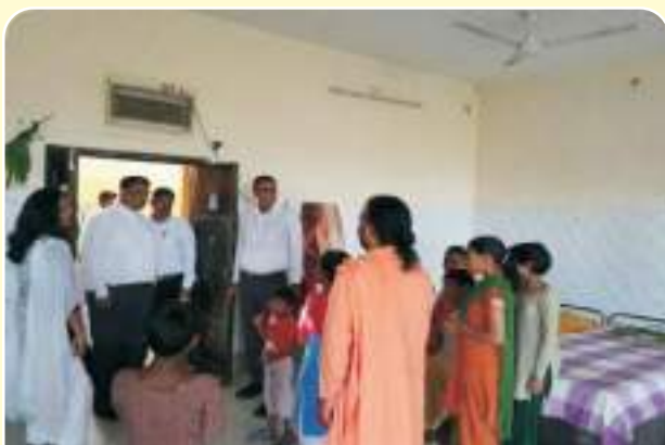
Shri Krishna Parnami Bal Sewa Ashram, Hisar