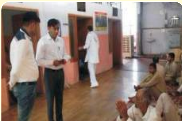
Bal Pryas Kunj and Shelter Home, Jind