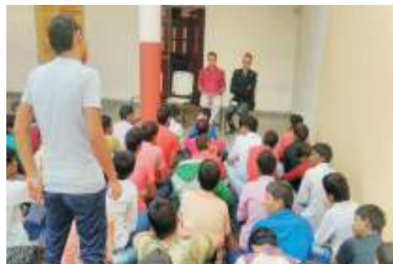
Observation Home Hisar

To ensure proper legal protection to the children the Chairpersons-cum-District and Sessions Judges alongwith Chief Judicial Magistrates-cum-Secretaries regularly visit Children Homes, Shelter Homes and Observation Homes across the State of Haryana under the instructions and guidance of the Haryana Legal Services Authority. Follow up reports are regularly sent to HALSA for taking up the issues with the quarter concerned.