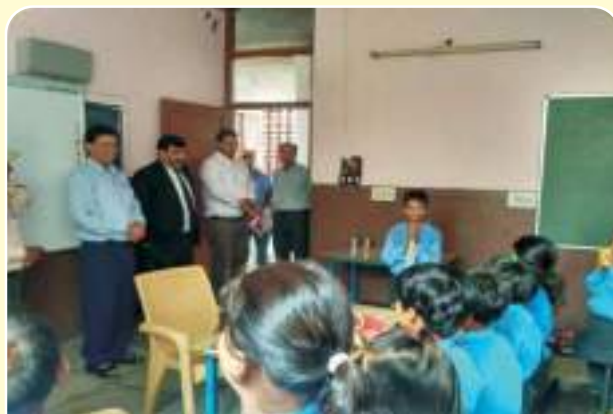
Child Care Home, Sonapat