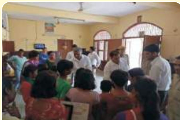
Shelter Home, Jhajjar