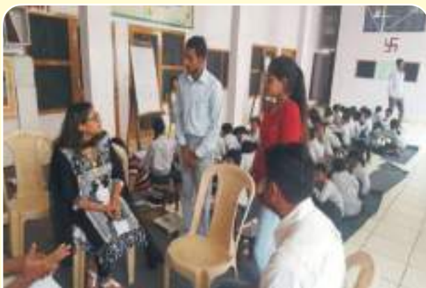
Vatsalya Vatika, Children Home, Kurukshetra