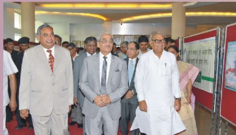
Visit of the Dignitaries in thematic presentation of drawing and painting skills of college and school students

Around 35% of India's population is illiterate. Majority of Indians live in villages. Bulk of the illiterates live in the rural areas, where social and economic barriers play an important role in keeping the lowest strata of society illiterate.