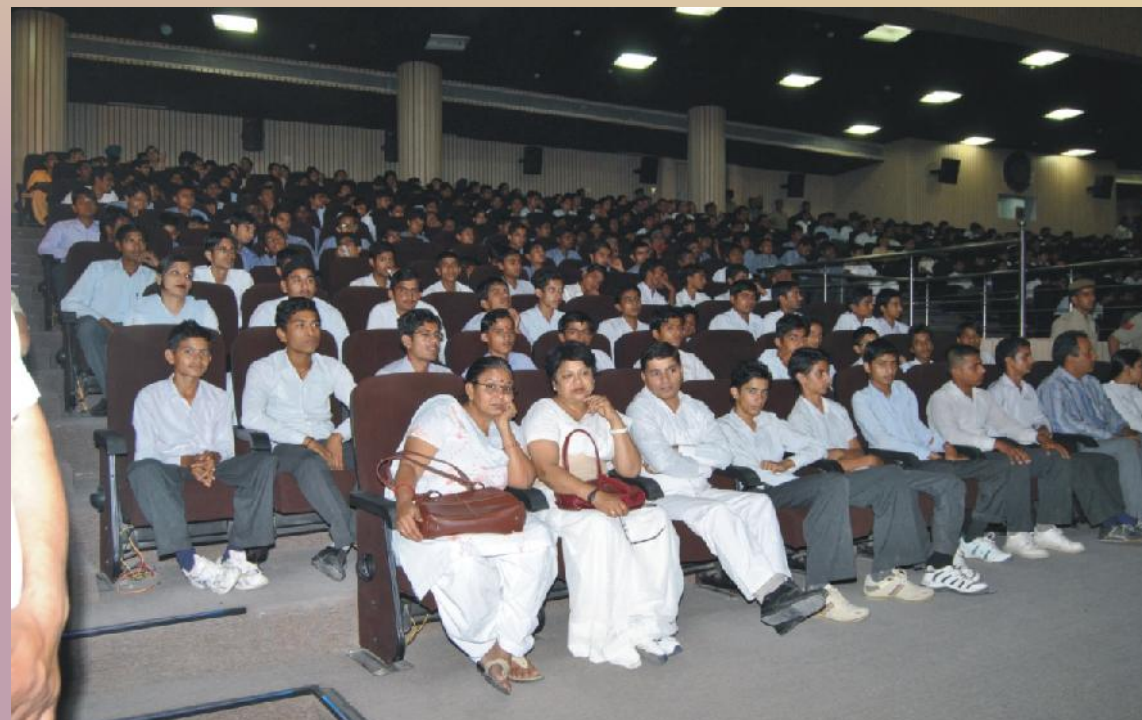
Presence of Gathering, Tagore Auditorium M.D. University, Rhotak

Approximately 26,500 students participated in these competitions at the various levels. The winners of the district level competitions competed at Divisional level i.e. Ambala, Rohtak, Gurgaon and Hissar. The State level function was held on 20.5.2012 at Tagore Auditorium, Maharshi Dayanand University, Rohtak and winners were awarded prizes of Rs.11,000/-, 8,000/- and 5,000/- for the first, second and third prizes respectively. Besides this Gold, Silver and Bronze medals were also given