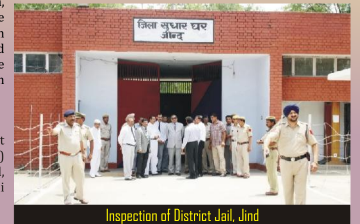
Inspection of District Jail, Jind