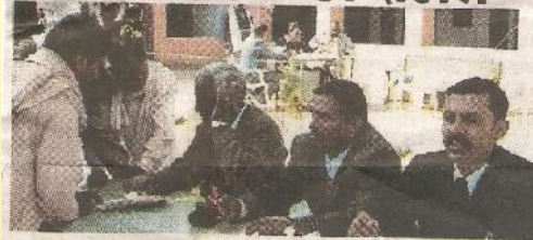
कलायत। गांव बात्ता में आयोजित गांवबाहल लोक अदालत में मामले सुनते वकील।