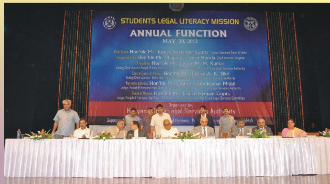
"Students Legal Literacy Mission" - Annual Function at Tagore Auditorium, M.D. University, Rohtak on 20th May, 2012