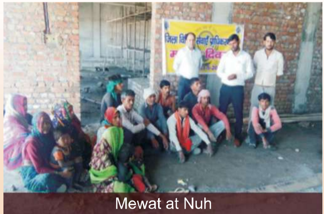
Mewat at Nuh