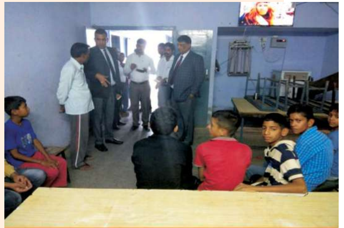
Children Home, Hissar