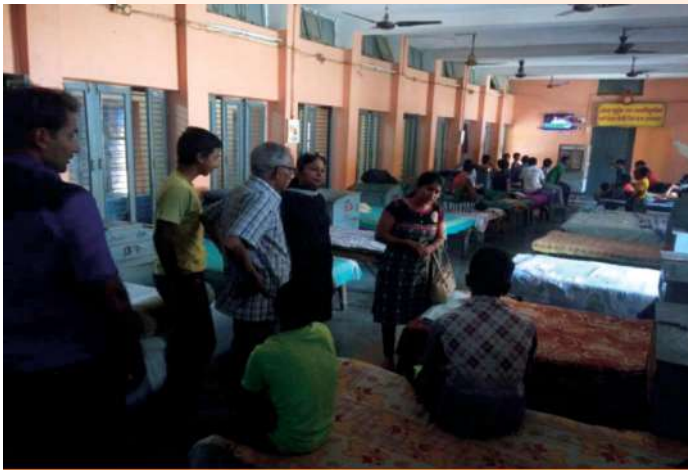
Shelter Home, Rohtak