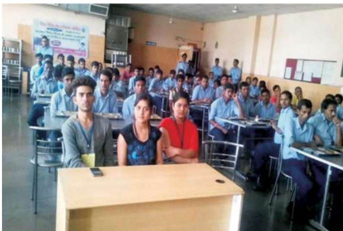
Revli, Murthal Road (Sonapat)