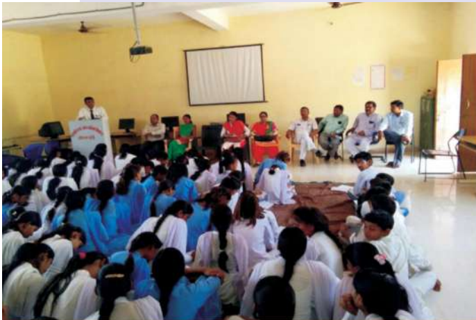
Nangal Dargu (Narnaul)