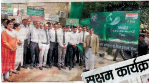
District and Sessions Judge MM Dhonchak flags off an anti-polythene awareness rally.