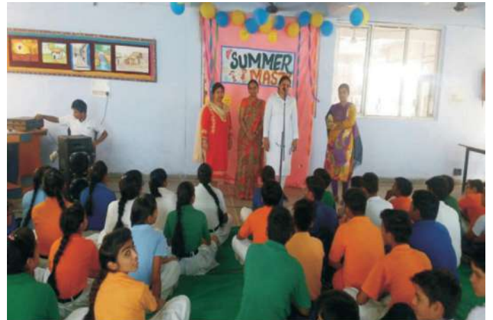
Sant Sofia Senior Secondary School (Hissar)