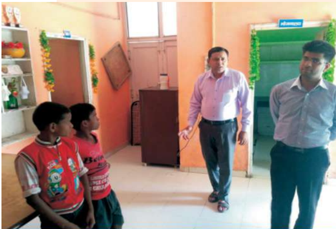
Observation Home, Yamuna Nagar