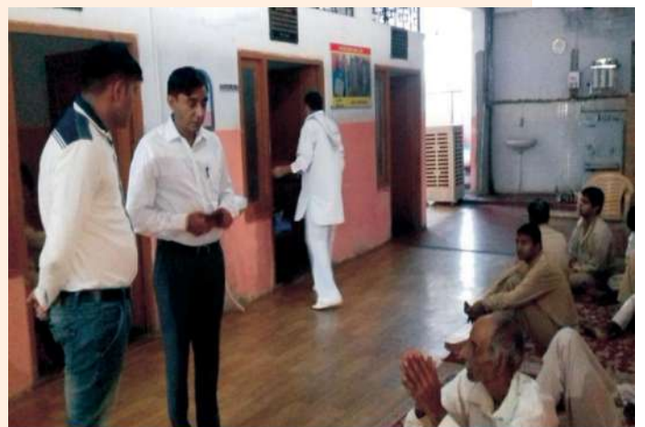
Shelter Home, Jind