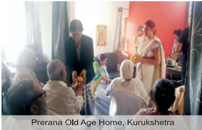
Prerana Old Age Home, Kurukshetra