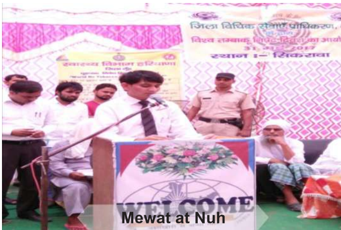
Mewat at Nuh