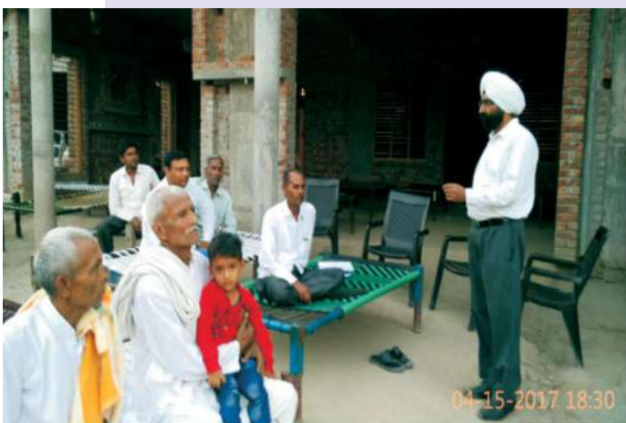
Tigra (Yamuna Nagar)