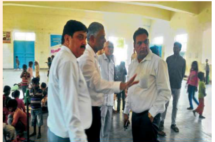
Shelter Home, Jhajjar