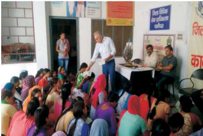
Hari Singh Colony, Noorwala (Panipat)

District Legal Services Authorities organized various legal awareness camps at different villages in the district of Sonapat, Kaithal, Rohtak, Sirsa, Panipat, Jind, Mewat, Palwal, Karnal, Ambala, Fatehabad, Faridabad, Gurgaon, Hissar, Jind, Jhajjar, Kurukshetra, Narnaul, Panchkula, Rewari and Yamuna Nagar. Various issues of socio-legal importance were discussed in these camps. The forms of the welfare schemes were filled to connect the villagers with the schemes.