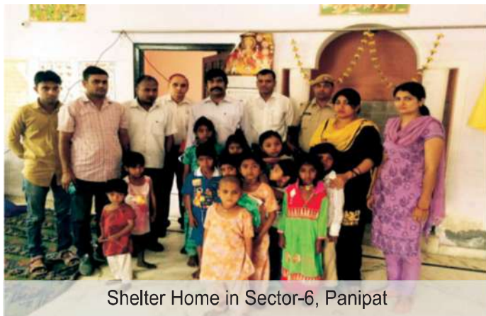
Shelter Home in Sector-6, Panipat