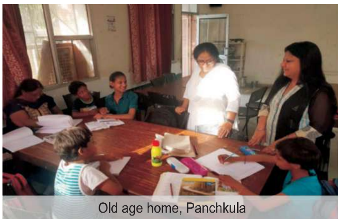
Old age home, Panchkula