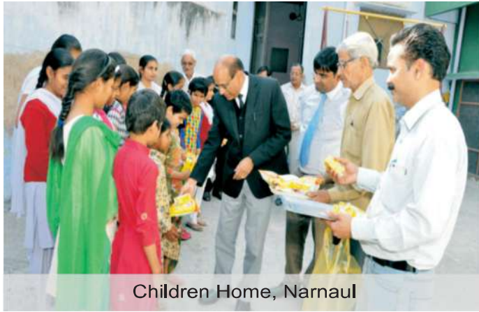
Children Home, Narnaul