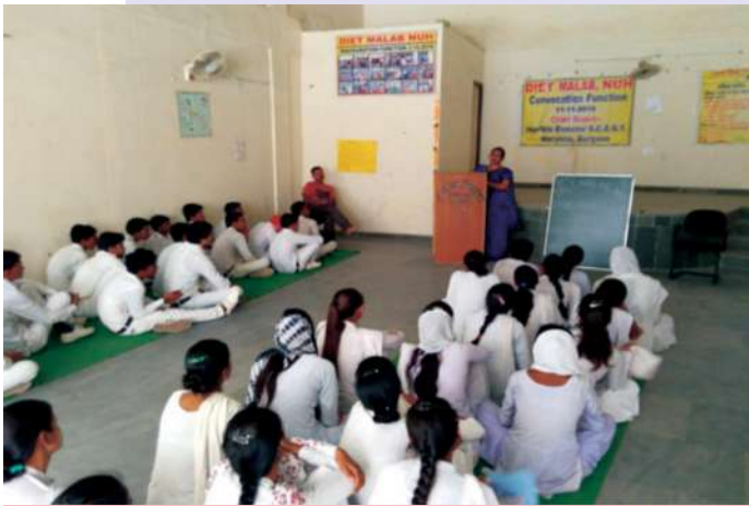
Sikrawa, Block Punhana (Mewat)