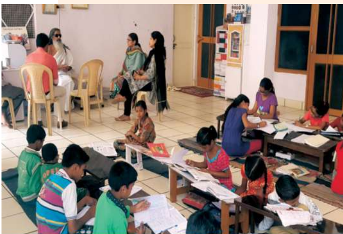
Observation Home, Kurukshetra