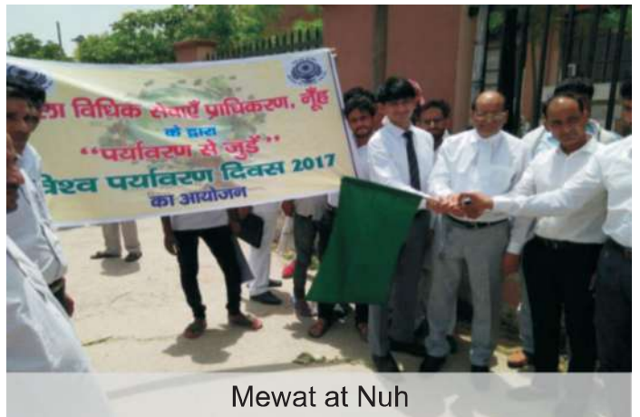
Mewat at Nuh