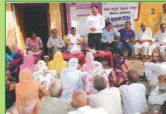
At General Chopal, Rajpur village Sonipat