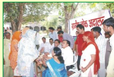
Mobile Rural Lok Adalat And Legal Literacy Camp District Faridabad

As per the schedule fixed by Haryana State Legal Services Authority, Rural Lok Adalats/Legal Awareness Camps at various places including schools and collages were organized in District Faridabad from 16.7.2013 till 31.7.2013 through Publicity Vehicles of HALSA i.e. Mobile Van/Swaraj Mazda.