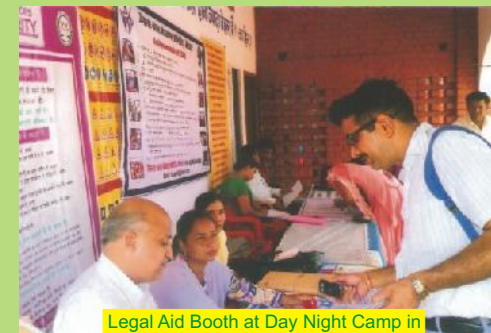
Legal Aid Booth at Day Night Camp in village Kalasar (Kaithal) on 12.7.2013

As per the directions issued by HALSA, DLSAs through its team of panel Advocates and PLVs have been joining District Administration in the Day Night Camps/ Night Halts organized by them by installing legal aid booth, where legal services are provided on the spot.