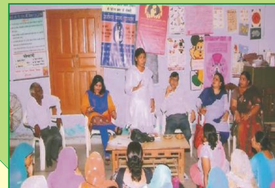
At Aanganwari Mahila Mandal Campus, Village Umari, Kurukshetra