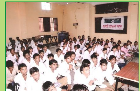
At village Uncha Gaon, Ballabgarh (Faridabad)