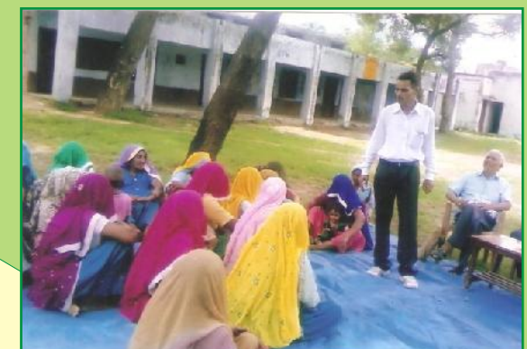
At village Kamalpur, District Rewari