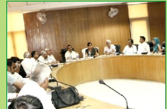
At conference Hall of DRDA, Rohtak