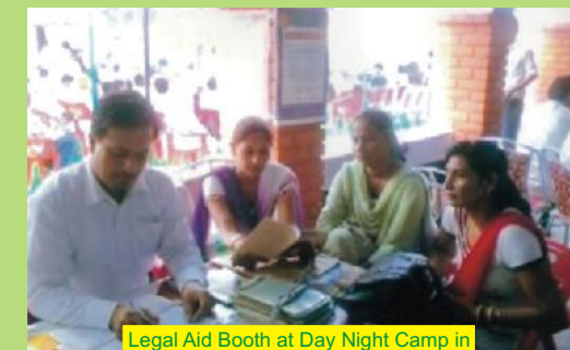
Legal Aid Booth at Day Night Camp in village Hamola (Kaithal) on 26.7.2013

Out of 24 Day Night Camps organized by District Administration, Kaithal since September, 2012, District Legal Services Authority, Kaithal has participated in 22 camps.