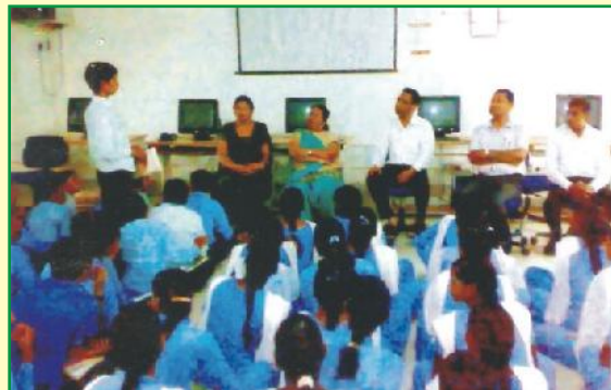
LLC organised in Govt. Sr. Sec. School, Village Bharokhan (Sirsa) on 8.7.2013

Detailed lectures are delivered on the subject of Right to Information Act, Child Labour, rights of juveniles, rights of senior citizens, concept of Permanent Lok Adalat, rights of disabled persons, child marriage, Consumer Protection Act and various help lines and legal aid clinics run by District Legal Services Authorities. Booklets published by HALSA and the pamphlets got printed by the Authority describing briefly the functions and the benefits of Permanent Lok Adalat for Public Utility Services were also distributed amongst the gathering.