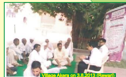
Village Akera on 3.8.2013 (Rewari)

Similarly, 11 Legal Literacy Camps were held through Mobile Bolero Van during 1.8.2013 to 15.8.2013 by Legal Aid Counsels/Para Legal Volunteers by District Legal Services Authority, Rewari. One Rural Lok Adalat was also organized on 11.8.2013 at village Bhalki.