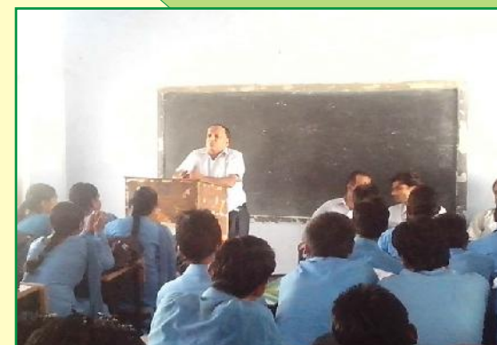
At Govt. School, Buria (Yamuna Nagar)