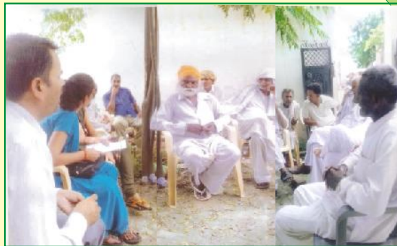
Legal Literacy Camp held on 11.8.2013 at Devigarh Road, Kaithal