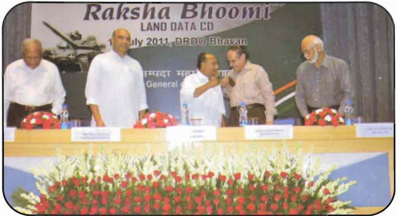
Release of Raksha Bhoomi Land Data CD by Shri A.K. Antony, Hon'ble Raksha Mantri