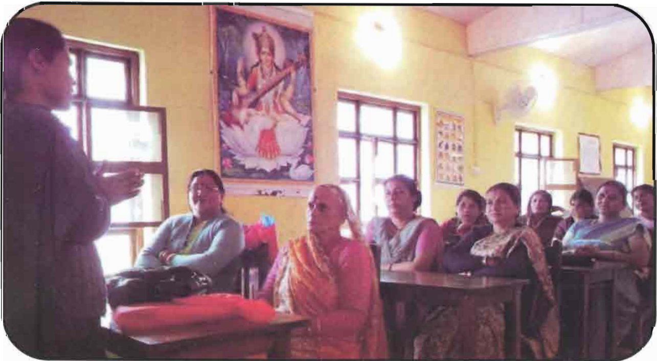
Mahila Samakhya-A workshop on women empowerment in Nainital Cantonment