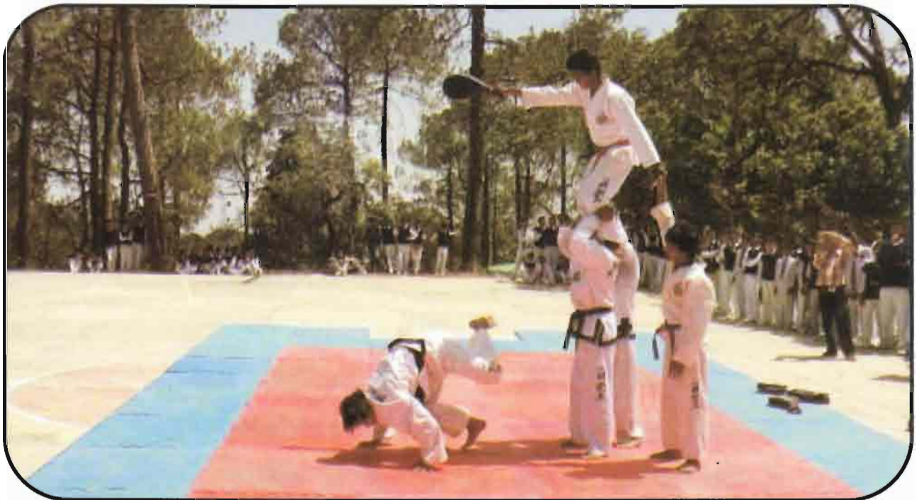
Martial Art Camp in Lansdowne Cantonment organized by Cantonment Board