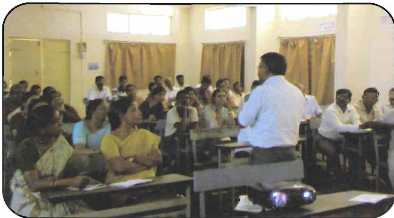
A Training Session for Cantonment Board Staff in RTC Dehu Road Cantonment