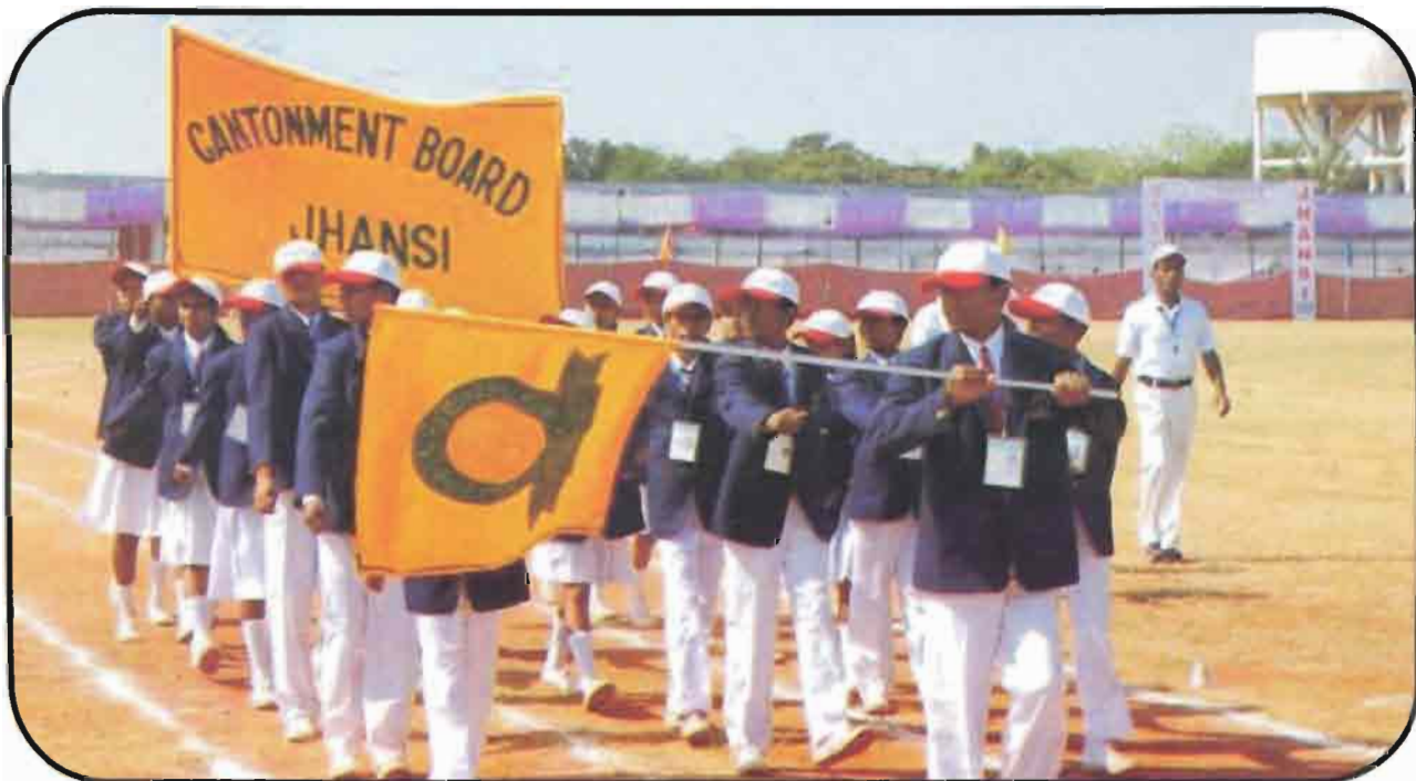
Sports & Cultural Meet of Cantonment Boards of Southern Command held in Jhansi Cantonment in Oct 2011 - March Past