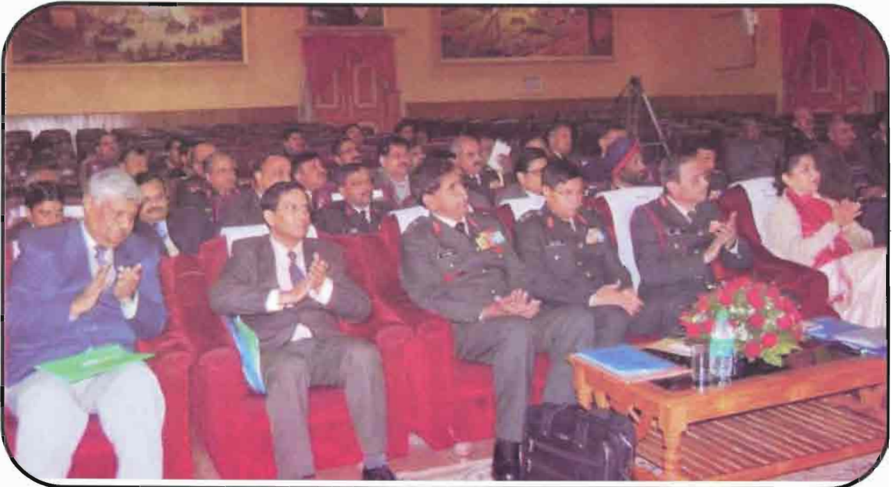
Conference of PCBs and CEOs of Central Command at Lucknow Cantonment