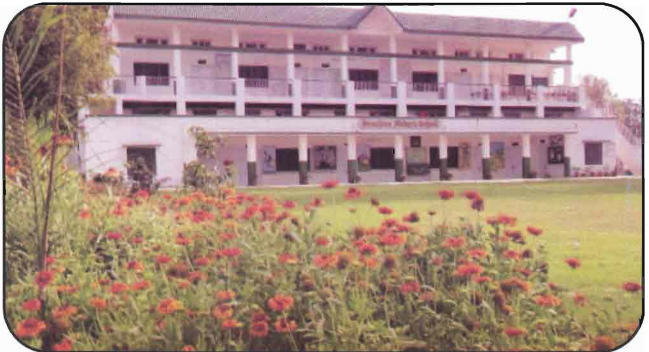
Sun Shine Modern School of Ferozpur Cantonment Board