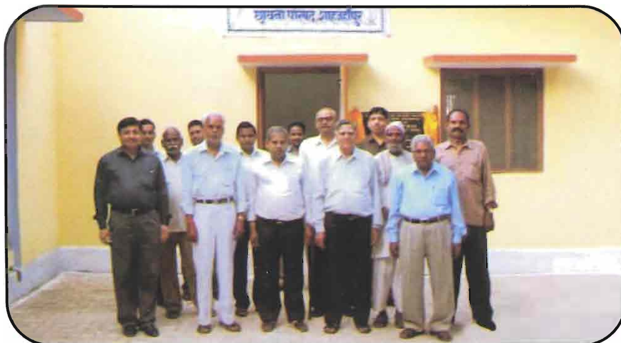
An Old Age Home in Cantonment Board Shahjahanpur