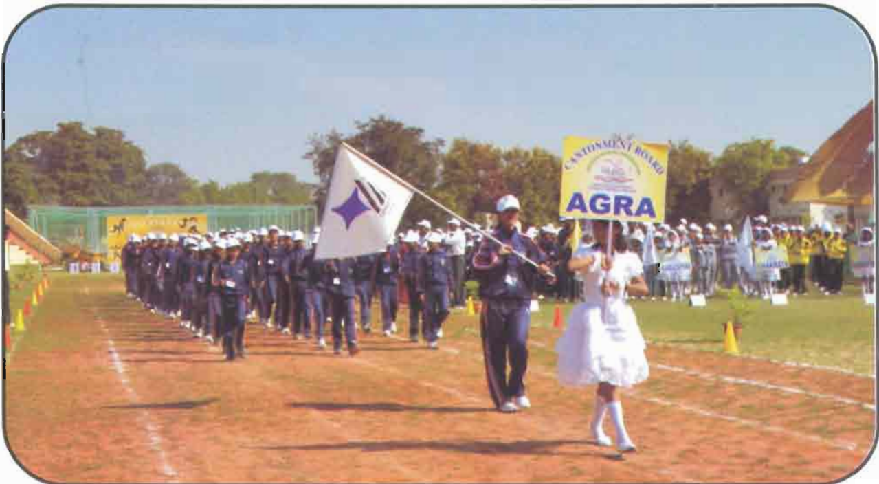
A Contingent of Agra Cantonment during Marchpast-Shikhar-A sportsmeet of Cantonment Boards of Central Command- Oct 2011