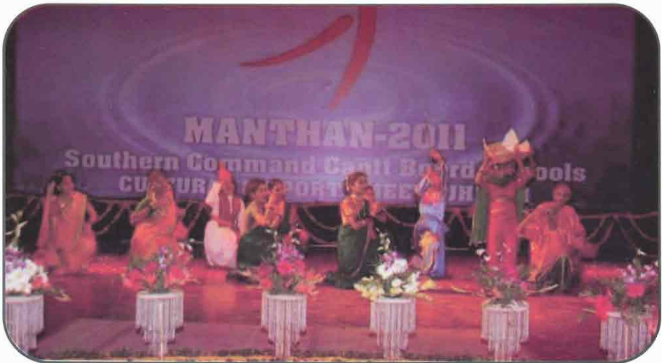
Manthan 2011 - Sports & Cultural Meet of Cantonment Board Schools of Southern Command at Jhansi Cantonment in Oct 2011