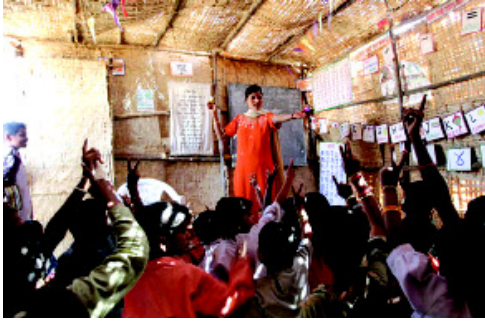
A typical Sakhar Shala