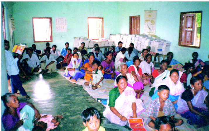
Meeting with the parents of RBC learners.

Setting up an RBC and managing it requires both high human and monetary resources. Therefore, facility of RBC is not provided to all out-of-school children. Only most 'difficult to reach' children are catered through RBCs. RBCs are run for child labourers rescued from employers, wage earning or non wage earning working children who stay with their families but bear the risk of dropping out even after enrollment in NRBCs or mainstreaming in formal schools. . In Assam, highest preference is given for child labours of 10-14 years of age and children living with extreme poverty.