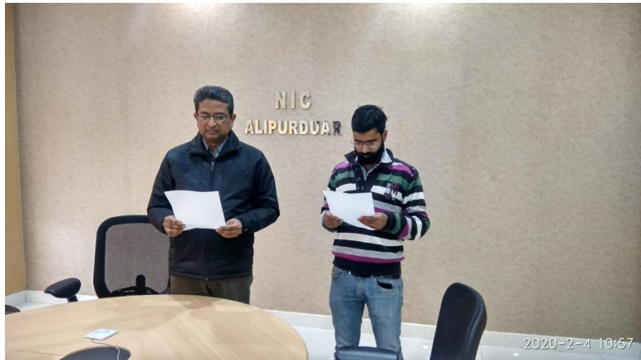
NIC District Centre – Alipurduar