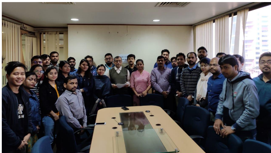
NIC STP II Centre