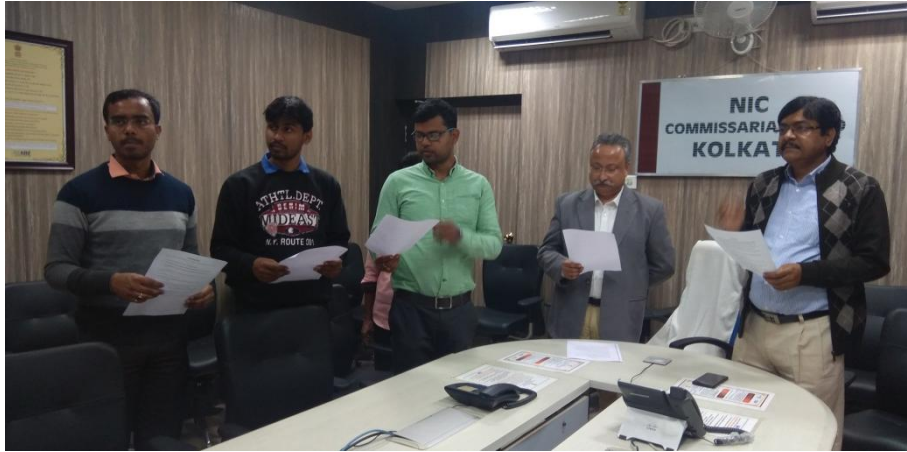
NIC Centre – Commissariat Road