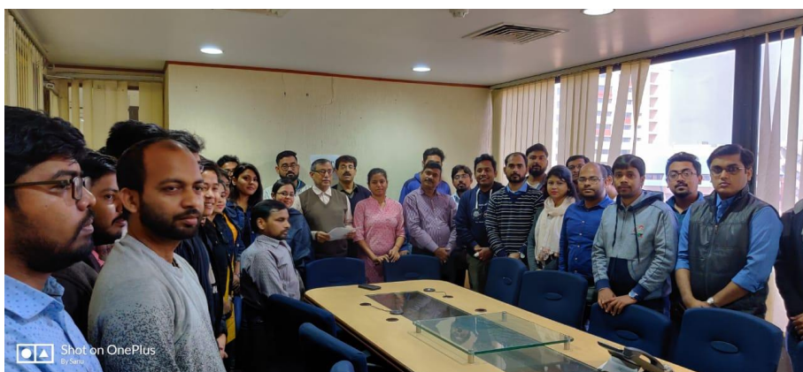
NIC STP II Centre