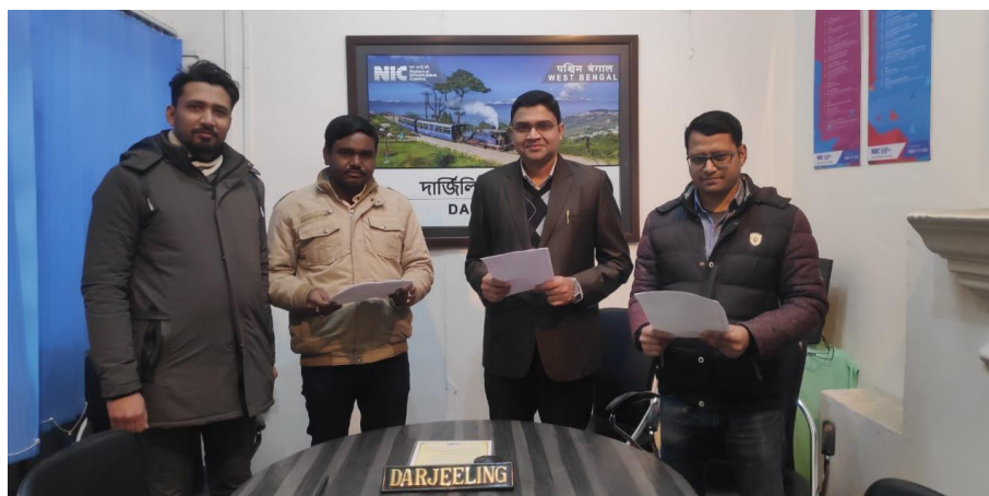
NIC District Centre - Darjeeling