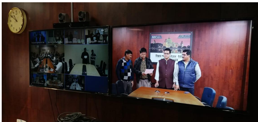
NIC i-NOC & Data Centre, Nizam Palace, Kolkata