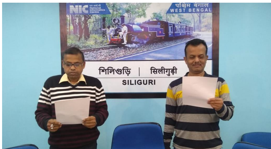
NIC District Centre - Uttarkanya (Siliguri)