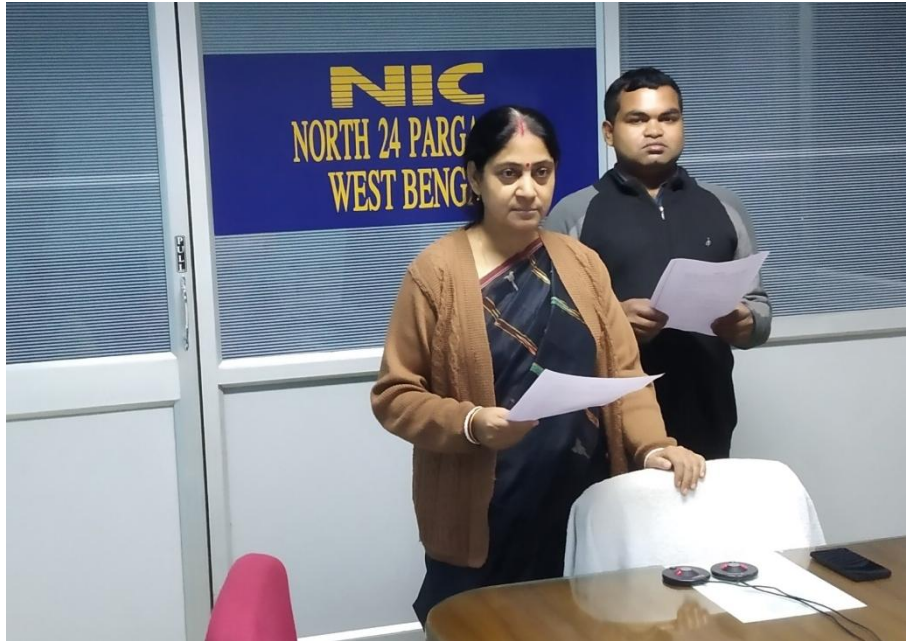
NIC District Centre – North 24 Parganas