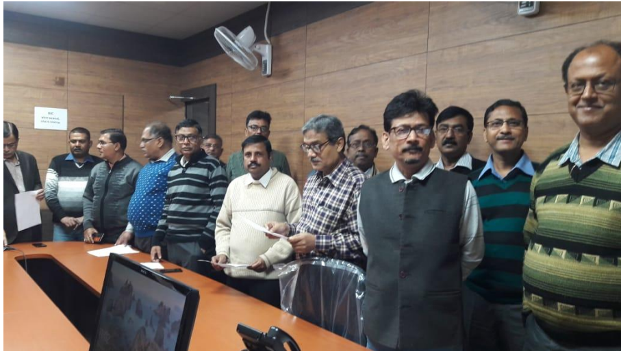
Pledge taking Ceremony at NIC-WBSC