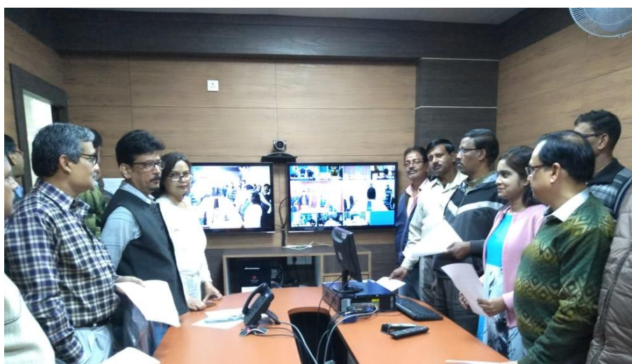
NIC-WB - Other centres are connected over VC