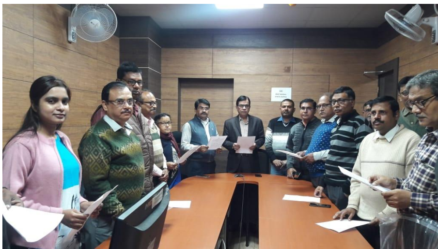
DDG & SIO participating in Pledge taking Ceremony at NIC-WBSC

Some pictures taken during the ‘Swachhta Pakhwada Pledge taking Ceremony’ as observed by NIC-WBSC and NIC district centres are enclosed herewith: