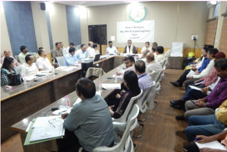
Honorable Union Minister of State Shri

Prahlad Singh Patel gave appointment letters under PM Rojgar Mela Programme.