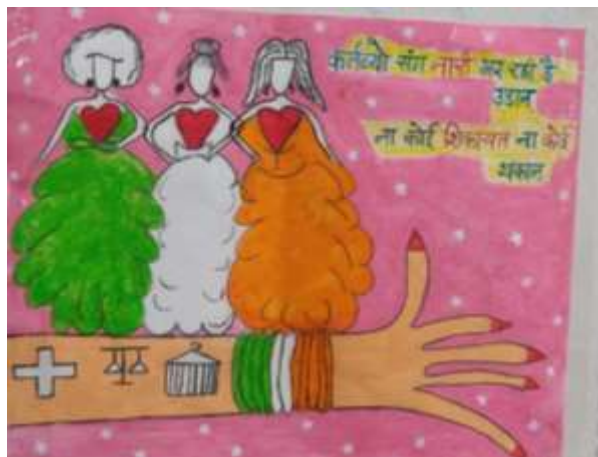
Paintings by participants

other participatory programs and distribution of prizes to winners.