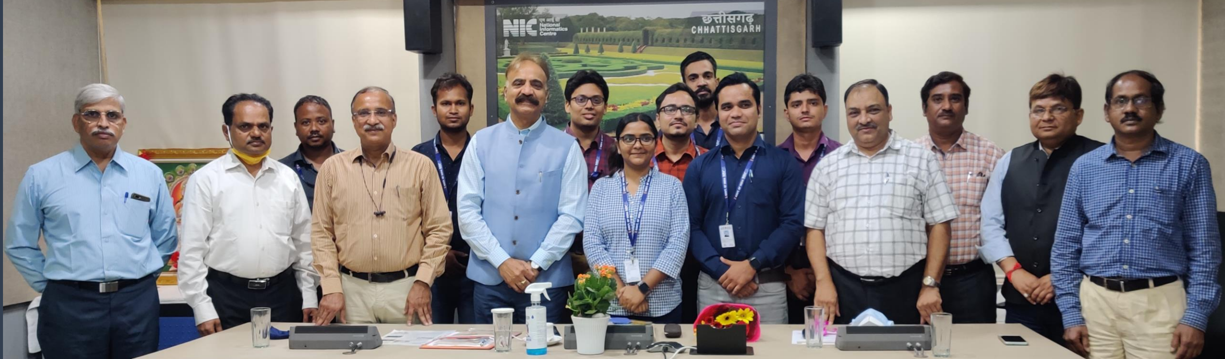
Group Photo with the Guest as a life time memory