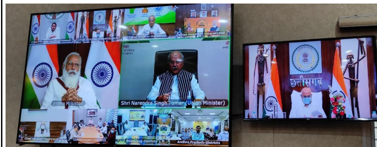
The National Panchayat Awards 2021 was conferred by Hon'ble PM Shri Narendra Modi in a virtual ceremony held in New Delhi on the occasion of National Panchayati Raj Day on 24 th April, 2021.

The Government of India conferred the national second prize under e-Panchayat awards to Chhattisgarh for its superior performance in the use of ICT (Information & Communication Technology) in Panchayats in a virtual ceremony on Panchayati Raj Diwas on 24 th Apr'2021.