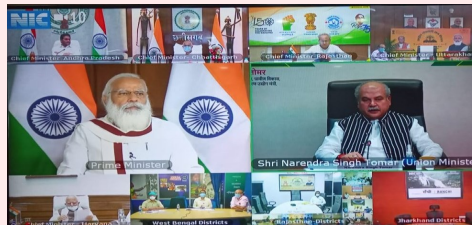
Video Conferencing of Hon'ble Prime Minister with CM of 10 most COVID-19 affected states on 23 April 2021.