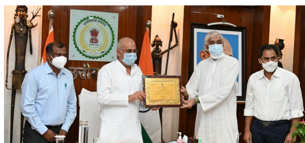
Hon'ble Panchayat and Rural Development Minister receiving E Panchayat Award 2021 from Hon'ble Chief Minister Chhattisgarh.