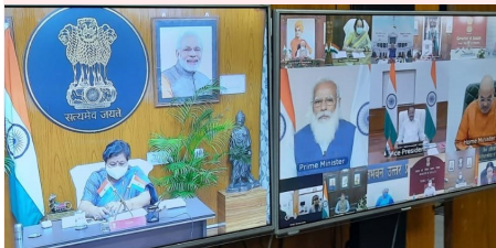
Video Conferencing of Hon'ble Prime Minister with all the Governors of the states and UTs on 14 April 2021.

Prime Minister Narendra Modi held a virtual review meeting on the Coronavirus pandemic with all the Governors of the states and UTs on 14 April 2021. Later Hon'ble Prime Minister held meeting on 23rd April 2021 with chief ministers of 10 most COVID-19 affected states. For these two high profile virtual meetings, NIC CG State Centre has made all necessary arrangements of high quality Video Conferencing and ensured uninterrupted service.