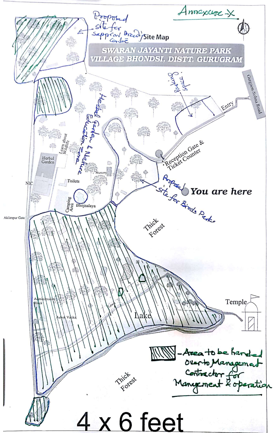
SITE MAP- NATURE CAMP, BHONDSI