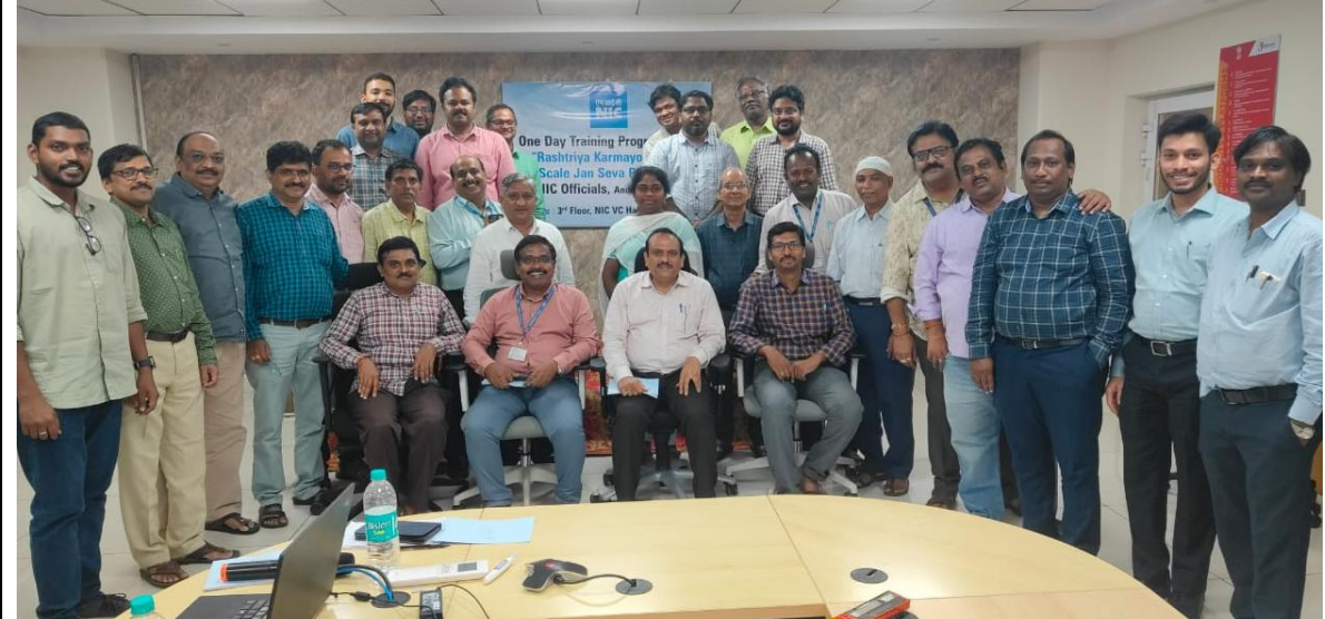
Group Photo of Batch-1 Officers