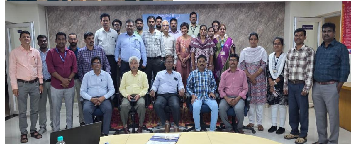
Group Photo of Batch2 Officers