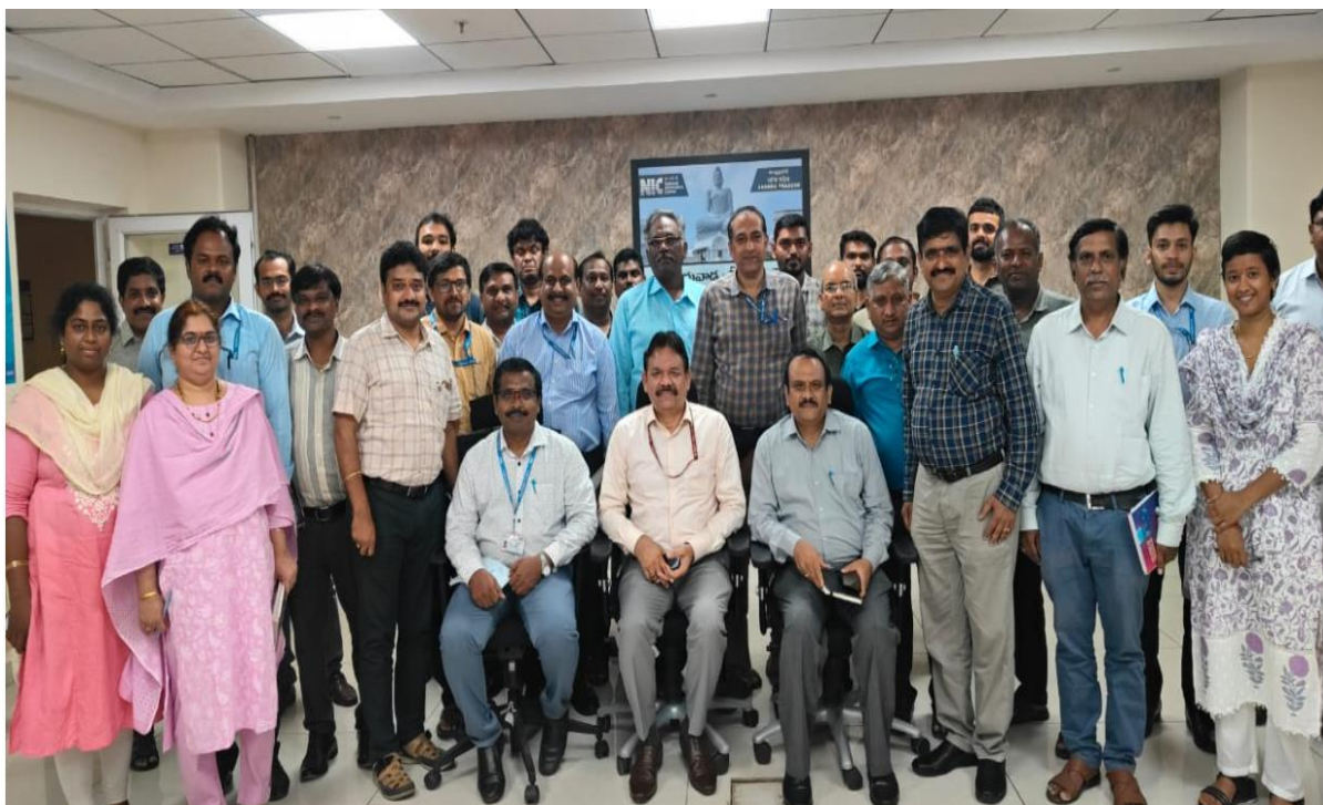
Group Photo of NIC Andhra Pradesh Officers along with State Coordinator