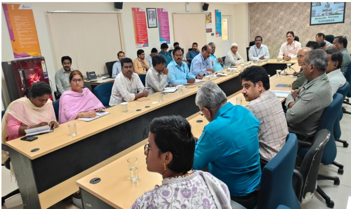
State Coordinator Interacting with Districts