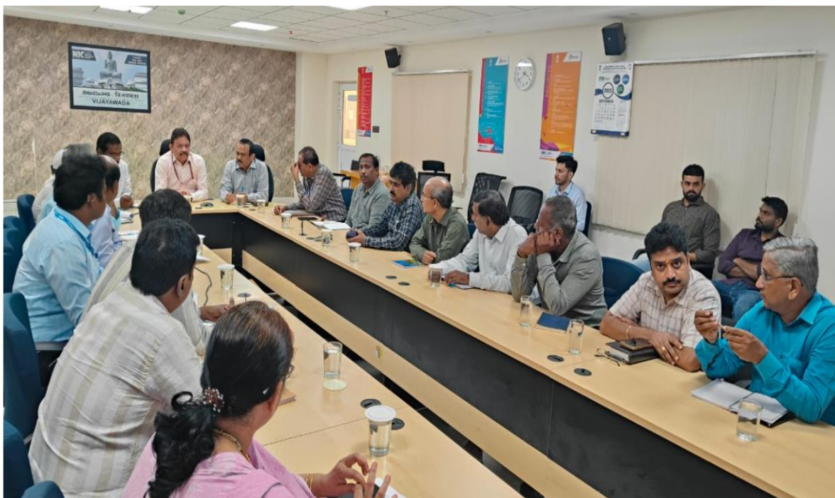
State Coordinator Interacting with State HoDs