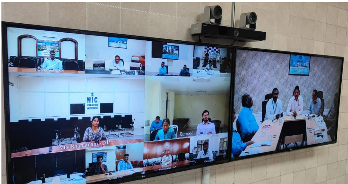
State Coordinator and SIO interacting with District officers through Video Conferencing