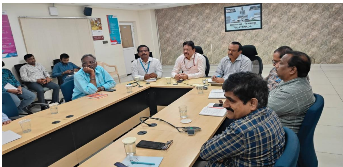
State Coordinator Reviewing the activities of District NIC Centres